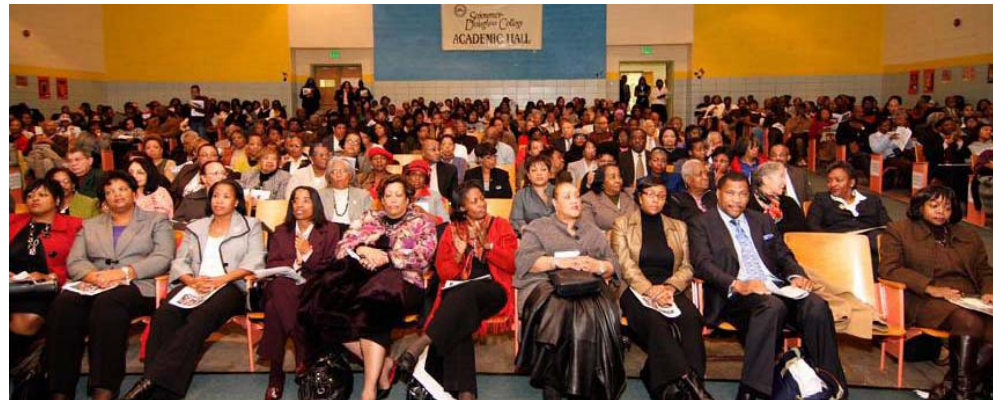
Donna Brazile audience