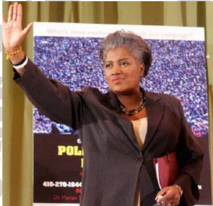
Ms. Donna Brazile, Political Strategist