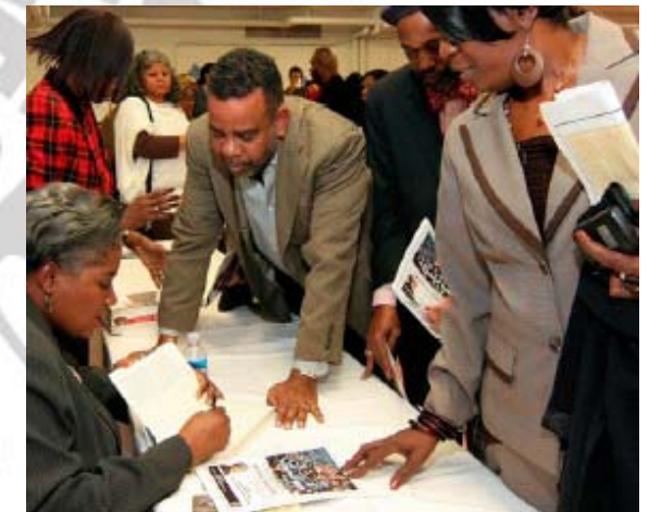
Ms. Brazile signing her book, "Cooking With Grease: Stirring the Pots in American Politics"